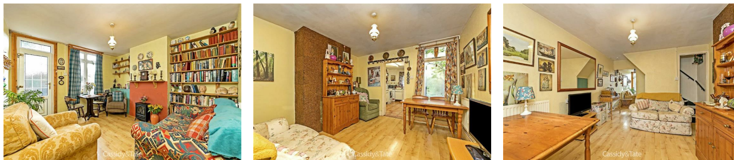
Ground Floor Approx. 35.2 sq. metres (379.0 sq. feet)

Set within the heart of Bernards Heath, in a popular central conservation area is this two bedroom terraced property which is in need of updating. The property has two reception rooms, kitchen, two double bedrooms and a first floor bathroom. Upper Heath Road is situated within the catchment of excellent schools, close to the open spaces of the heath itself and the adjoining woodland. St Albans city centre with its wide range of shops, bars and restaurants and the mainline station are both within walking distance.